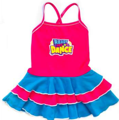
Ready Set Dance (Girls) Leotard

Due to licensing, Ready Set Dance, Ballet, and Acro uniforms are not available from Dancewear Suppliers. To make things convenient, our Kinder uniform is also exclusively available from our studio on-site store.