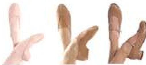
Theatrical Pink Ballet, Tan Jazz & Tap Shoes