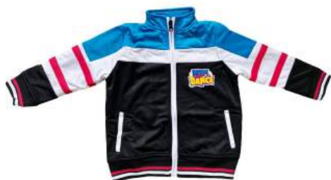
Ready Set Jacket