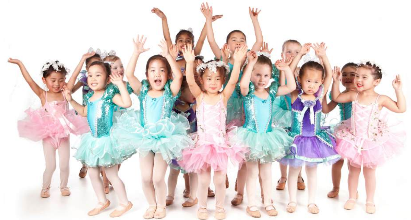
DanceStruck Kinder Graduates

Working towards to our performances is a fun way to develop dance skills, learning & retention of dance basics, technique, team work and self-confidence in a very exciting way.