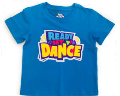
Ready Set Dance (Boys) Attire