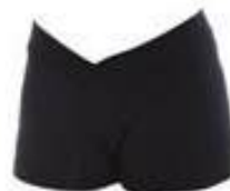
Black V-Band Jazz & Tap Shorts