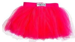
Ready Set Ballet Skirt