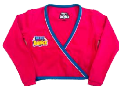
Ready Set Crossover